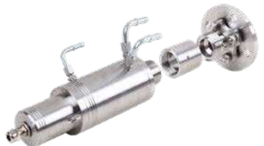
Series 54/55 with cooling jacket including air purge, sleeve for ball flange and ball flange