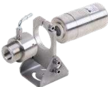
Series 54/55 with air purge unit and adjustable mounting angle