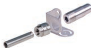
Series 4x with sighting tube, air purge unit and mounting angle