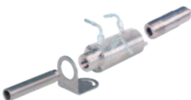
Series 4x with sighting tube, mounting angle and cooling jacket including air purge