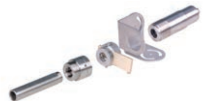
Series 4x with sighting tube, air purge unit, window slide and mounting angle