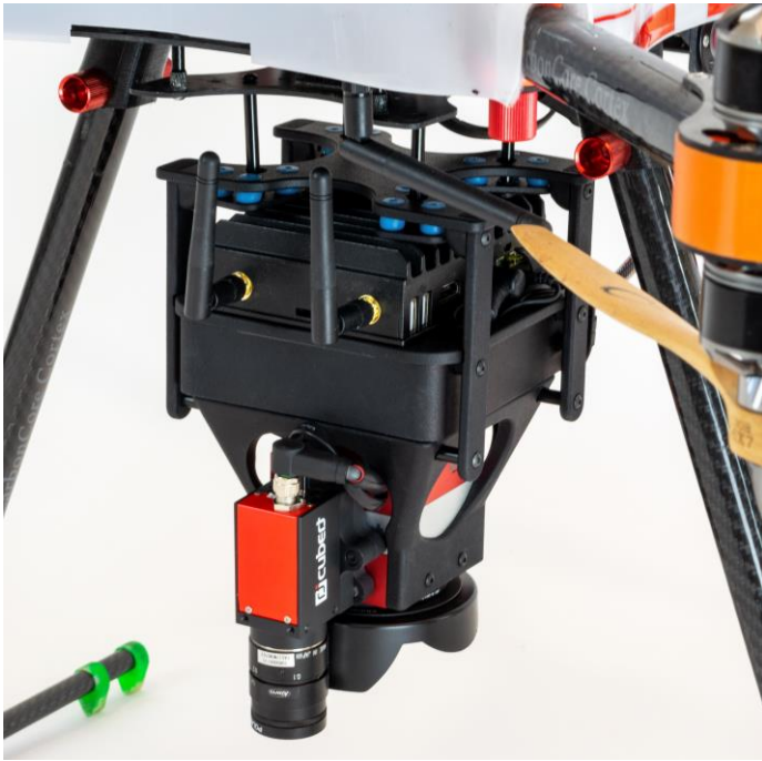
Easy integration on a UAS together with the Cubert mounting kit, compatible with any drone